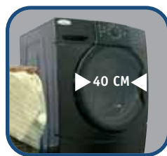
Large opening door. More quality and sturdiness with the double hinges

Whirlpool pairs up Semi-professional washing and drying functionalities using the same space and same aesthetic. In addition, 2 big drawers can elevate the machines allowing for an easier loading and unloading of linens besides providing storage space.