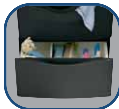
Optional drawer to install at the base of the products with a 33 cm height