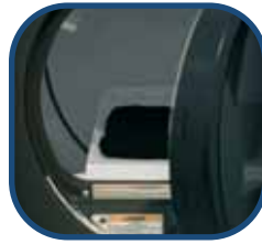
Grill to safely dry delicates items

The stacking kit allows to install washer and dryer on top of each other and it's included into the packaging of the dryer.